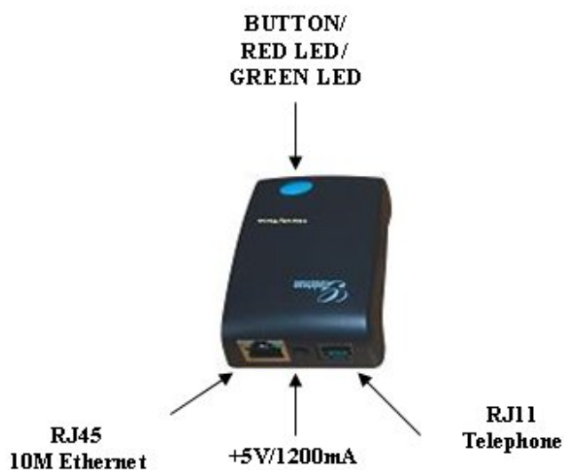
TABLE 1: DEFINITIONS OF THE HT-286 CONNECTORS